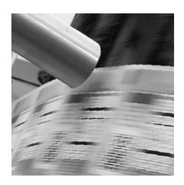
CIJ can keep pace with high speed flow wrappers

With CIJ, printed characters are made up of individual ink drops. The motion of the product or film provides one axis (length) of printed characters and the printhead provides the height axis by applying different charges on the drops and causing them to hit the film at different points. This method of marking is used most often to print alphanumeric codes such as expiration dates or manufacturing data. Matched with application specific inks and solvents, this type of printer can be used on nearly all types of package types and speeds.